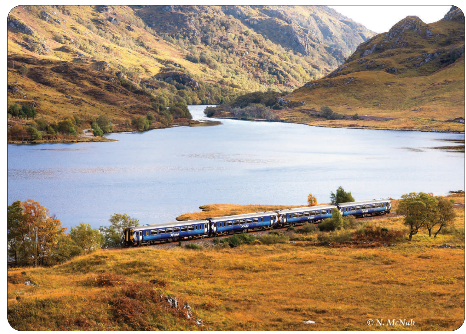
THE BEAUTY OF TRAIN TRAVEL IN SCOTLAND: The 10.10 train from Mallaig to Fort William and Glasgow Queen Street, a pair of class 156 diesel multiple units passing Loch Eilt on 15 October. The A830 is on the far side of the loch