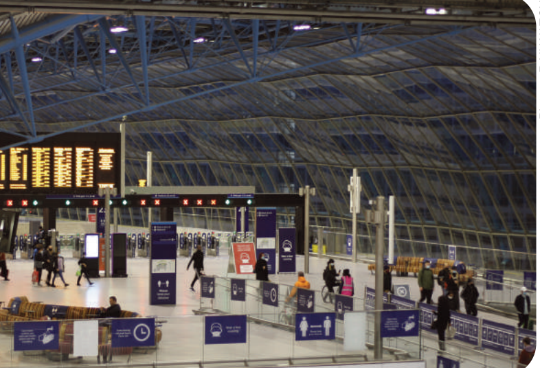
RUSH HOUR: Plenty of room to spare as a few passengers pass through the former Eurostar platforms at London's Waterloo station at 18.00 on 26 October 2020