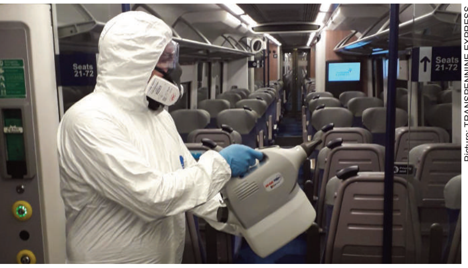
REASSURANCE: Overnight cleaning on board a TransPennine Express train. TPE recruited 57 extra cleaning staff in October as part of a £1.7 million boost to its 'robust' train and station cleaning programme. Toilet attendants were also being recruited for Huddersfield, Hull and Manchester Airport stations

Were You There? is available for £20 (post free) directly from the publishers, Empire Publications: www.empire-uk.com/FTH Richard encourages Railwatch readers to resist any temptation to buy "via a wide South American river", although Were You There? will also be available later as a Kindle e-book.