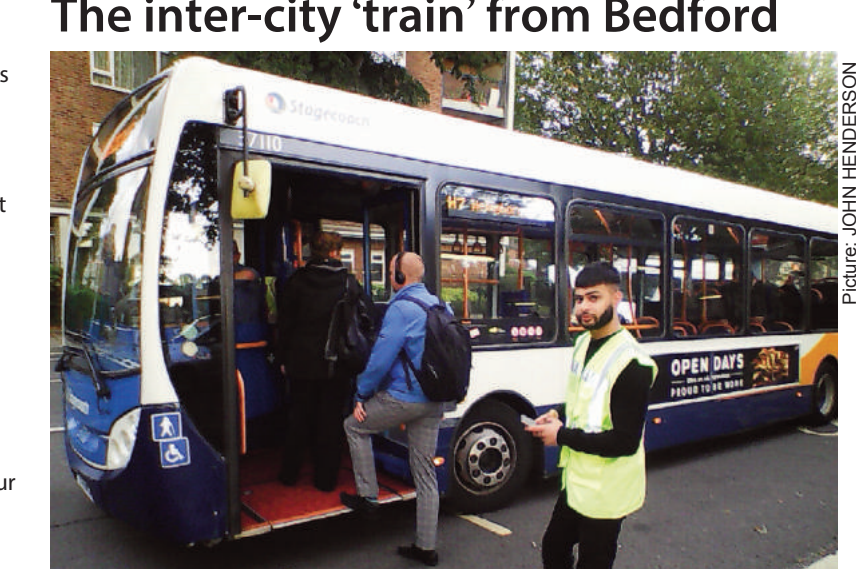
BUSTITUTION: Passengers at Bedford travel to Wellingborough