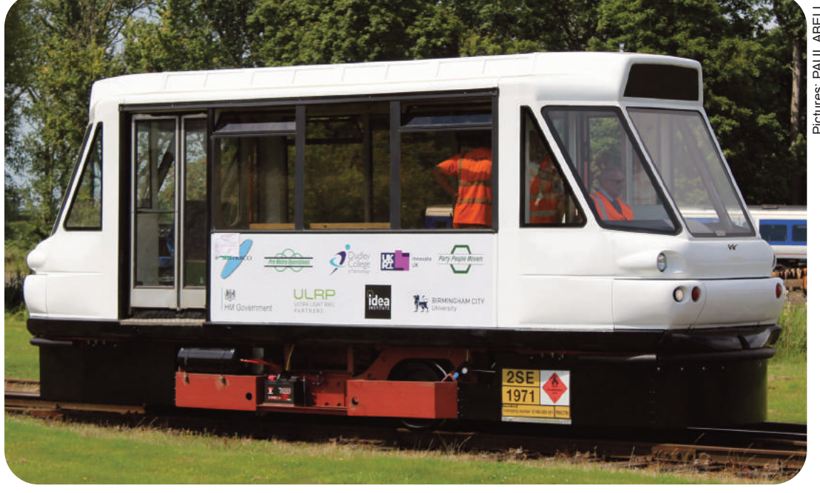
LIGHT FANTASTIC: Fuelled by biomethane, the ultra light railcar in action at Long Marston

The biomethane is produced using an anaerobic digester, which typically delivers a product containing around 70% methane. This is refined to give a fuel which is 98% methane. However the biogas from the anaerobic digester also typically