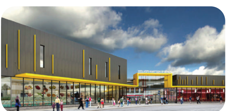
IMPRESSION: The planned Wolverhampton interchange