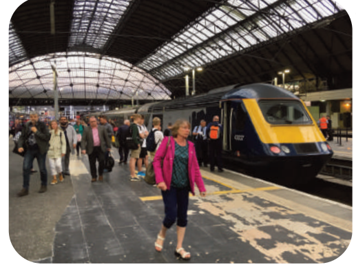
HALF WAY THERE: Glasgow Queen Street station in 2019 with a ScotRail Inter7City train. These refurbished inter-city trains

The cost-effective idea won major support in 2005 from the Strathclyde Partnership for Transport, but progress has stalled as Transport Scotland considers more grandiose and expensive plans.