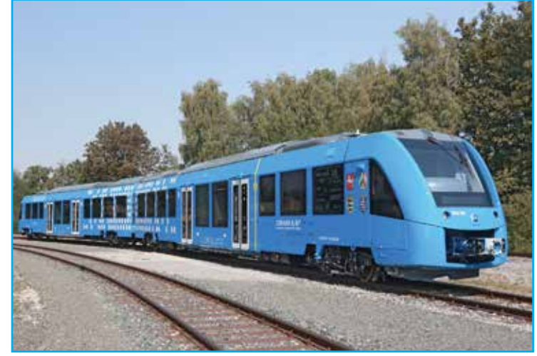
HYDROGEN POWER: Alstom's Coradia iLint train for Germany

The Department for Transport has also hinted that hydrogen trains could run on branch lines that are unlikely ever to be electrified. Alstom has reportedly