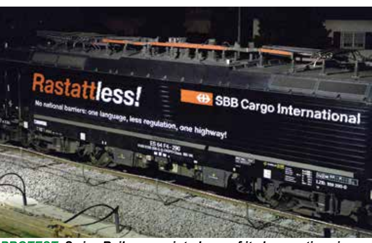
PROTEST: Swiss Railways painted one of its locomotives in response to the Rastatt tunnel collapse. The tag line reads 'No national barriers: one language, less regulation, one highway!