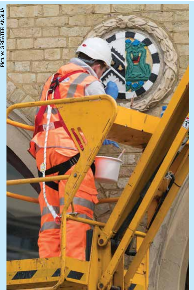
CAMBRIDGE STATION: Craftsman at work on the roundels

The letter in Railwatch 154 headed "Crewe mess-up" is unfair to those involved. The Department for Transport, to its credit, took advantage in 2008 of the extra capacity from four-tracking past Lichfield to