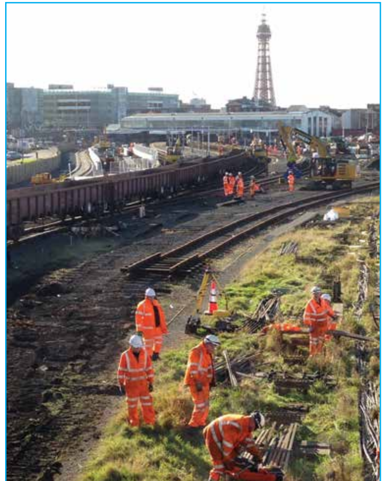
BLACKPOOL NORTH: Track re-laying under way in November. Electrification should mean Pendolinos can call later this year

Blackpool North MP Paul Mavnard, a former transport minister, said: "We are at the dawn of a golden age for Blackpool's rail link, following a transformation