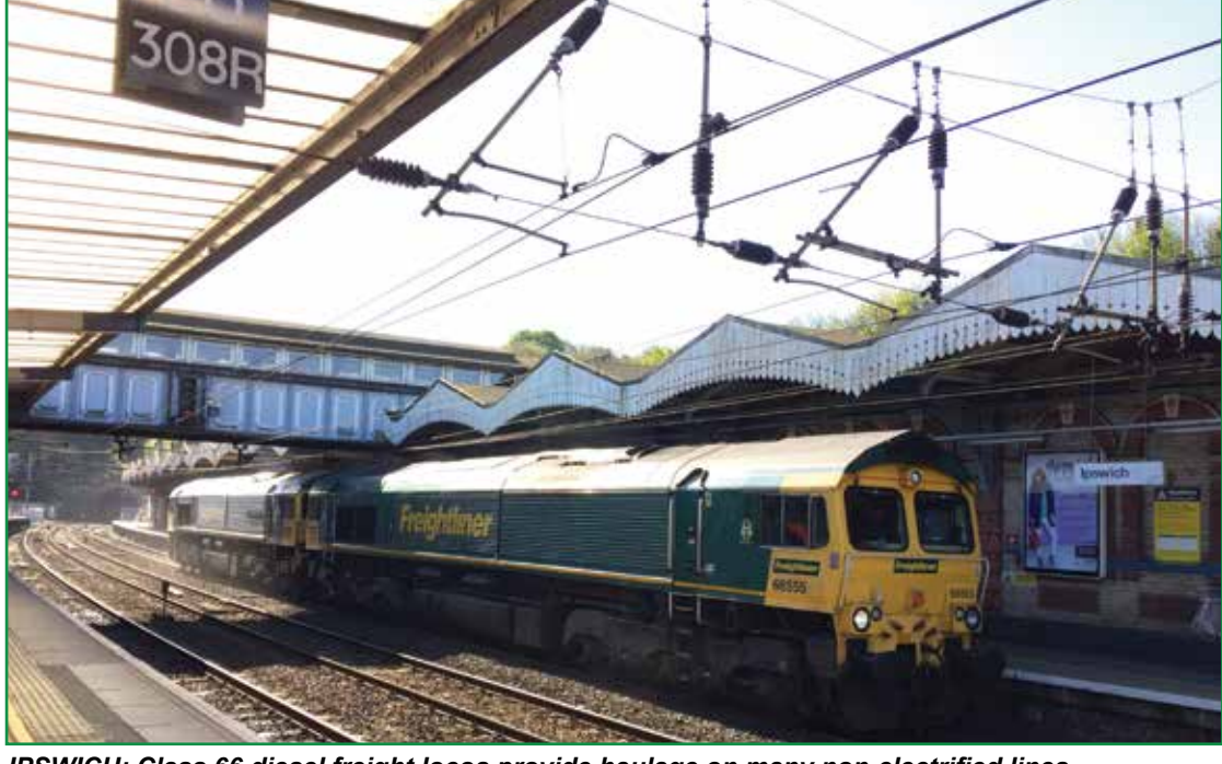
IPSWICH: Class 66 diesel freight locos provide haulage on many non-electrified lines

website or email lottery@railfuture.org.uk.