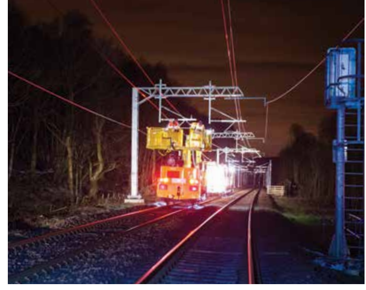
SCOTLAND SHOWS THE WAY: Work to electrify the Glasgow-Edinburgh line via Falkirk Grahamston. There will soon be five electrified routes between the two cities. Manchester, Leeds and Sheffield will have to make do with diesels - and dreams

It would however be difficult to convince the House of Commons public accounts committee, which has been concentrating on short-term lack of efficiency. Railfuture must nevertheless campaign vigorously, especially