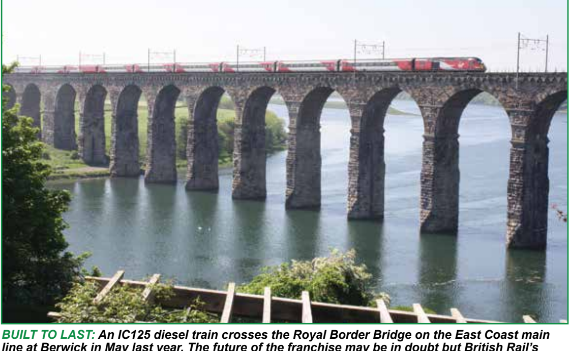
line at Berwick in May last year. The future of the franchise may be in doubt but British Rail's IC125 trains and the bridge are likely to survive long into the future

The East Coast franchise, heavily geared towards revenue growth, is a worry for the entire rail industry, and one which suggests that the franchise model is