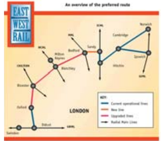
The Bedford to Sandy section, left, would unlock a long-distance rail link, above

One of the most crucial rail projects in Britain is still waiting for government support. Back in the 1980s British Rail was about to start running trains on part of the route.