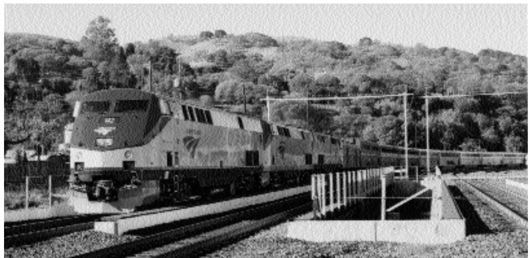
THE LONG WAY: The California Zephyr at Martinez en route from Oakland to Chicago