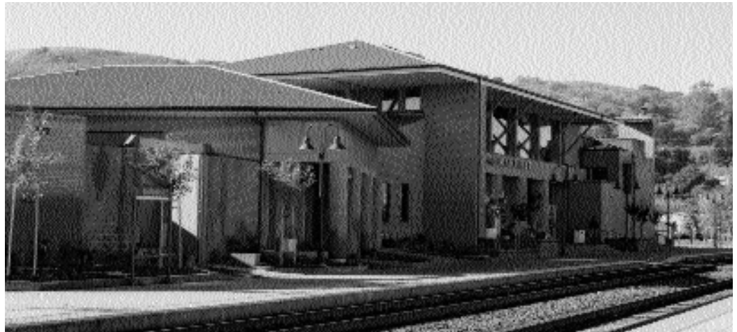
THINK BIG: The new station at Martinez which is an inter-city interchange in California

What a contrast to here where we have to pay through the nose or else book in advance to travel in some cramped, uncomfortable seat with a whole swathe of