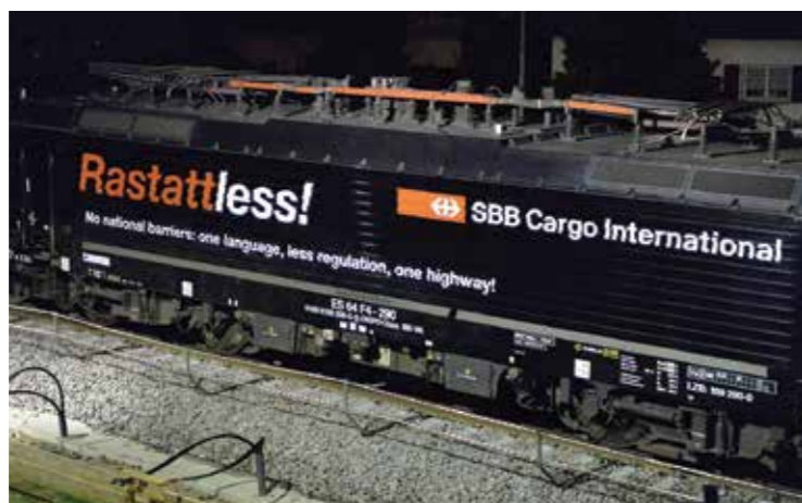
PROTEST: Swiss Railways painted one of its locomotives in response to the Rastatt tunnel collapse. The tag line reads 'No national barriers: one language, less regulation, one highway!'