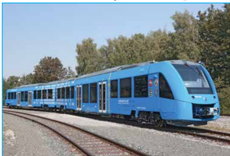
HYDROGEN POWER: Alstom's Coradia iLint train for Germany

The Department for Transport has also hinted that hydrogen trains could run on branch lines that are unlikely ever to be electrified. Alstom has reportedly