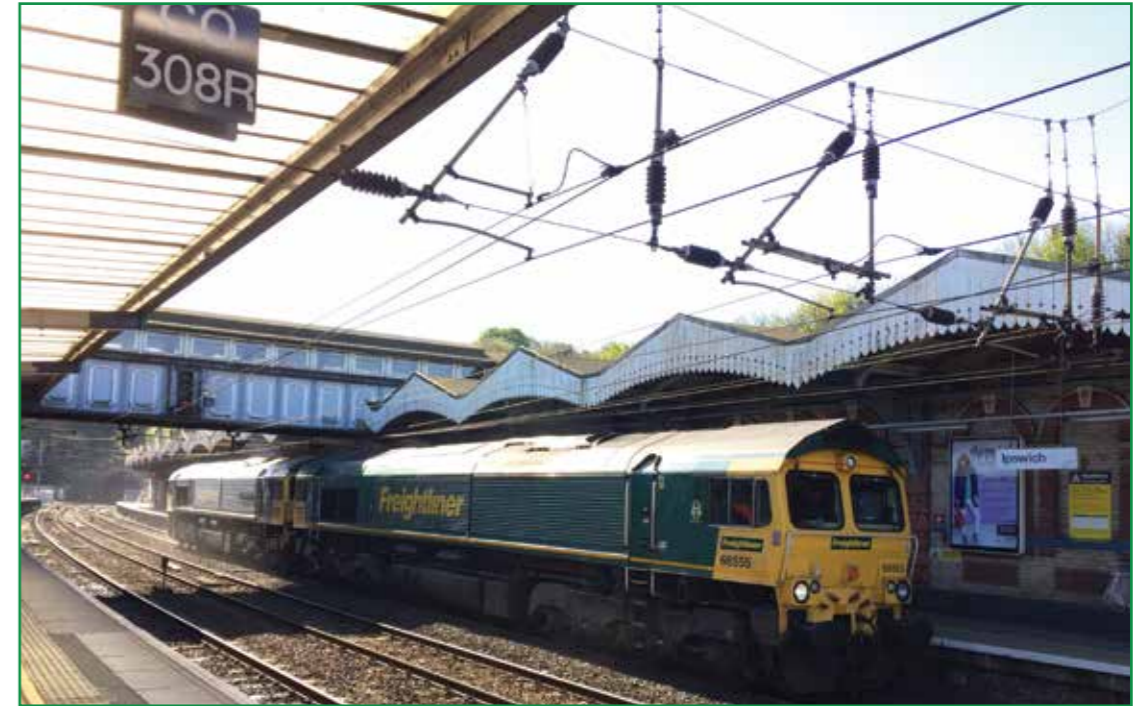
IPSWICH: Class 66 diesel freight locos provide haulage on many non-electrified lines

Thirty miles north of Cricklewood there are plans for another