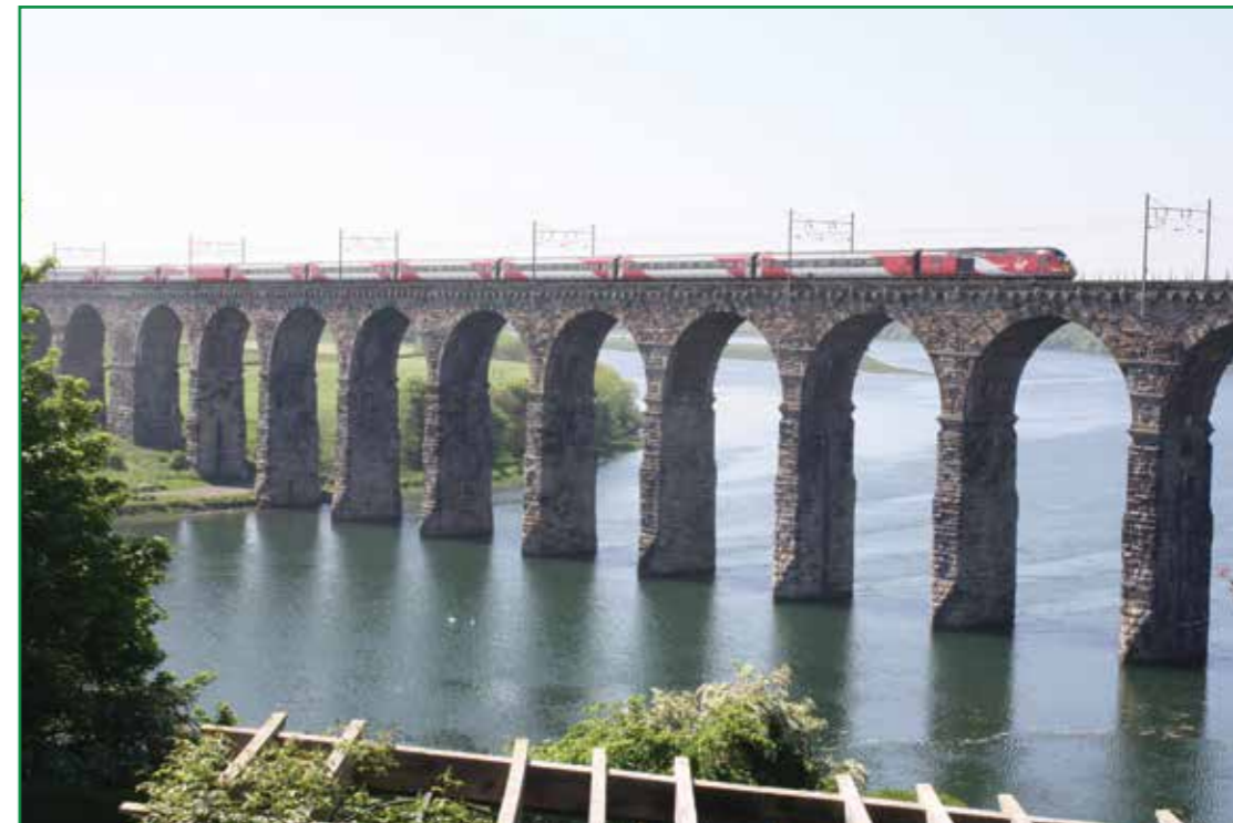
BUILT TO LAST: An IC125 diesel train crosses the Royal Border Bridge on the East Coast main line at Berwick in May last year. The future of the franchise may be in doubt but British Rail's IC125 trains and the bridge are likely to survive long into the future

The East Coast franchise, heavily geared towards revenue growth, is a worry for the entire rail industry, and one which suggests that the franchise model is