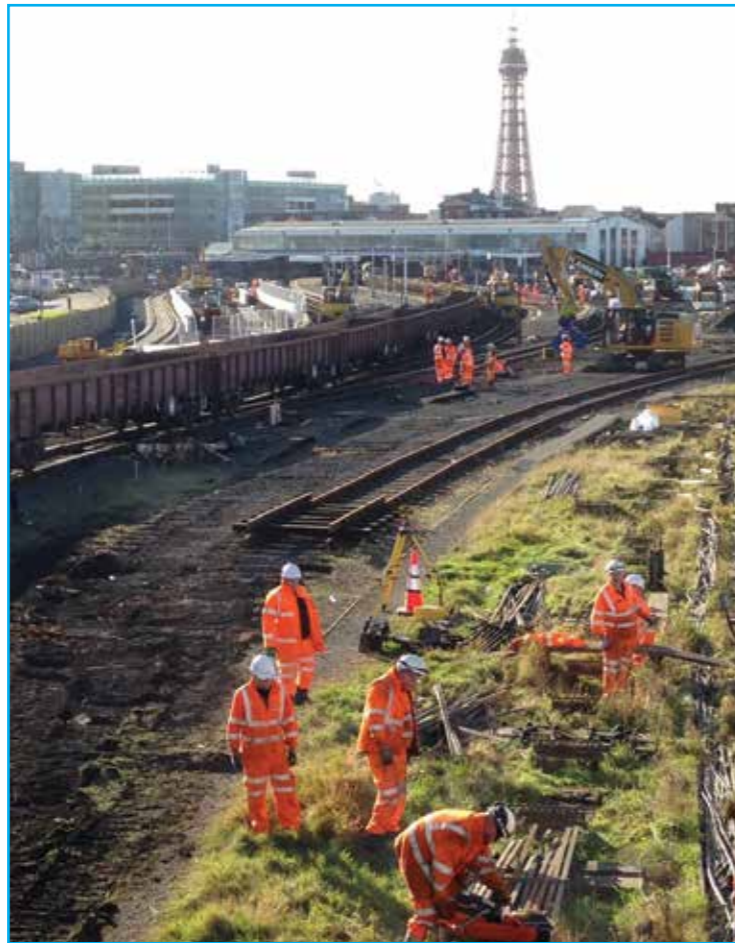
BLACKPOOL NORTH: Track re-laying under way in November. Electrification should mean Pendolinos can call later this year

Blackpool North MP Paul Maynard, a former transport minister, said: "We are at the dawn of a golden age for Blackpool's rail link, following a transformation