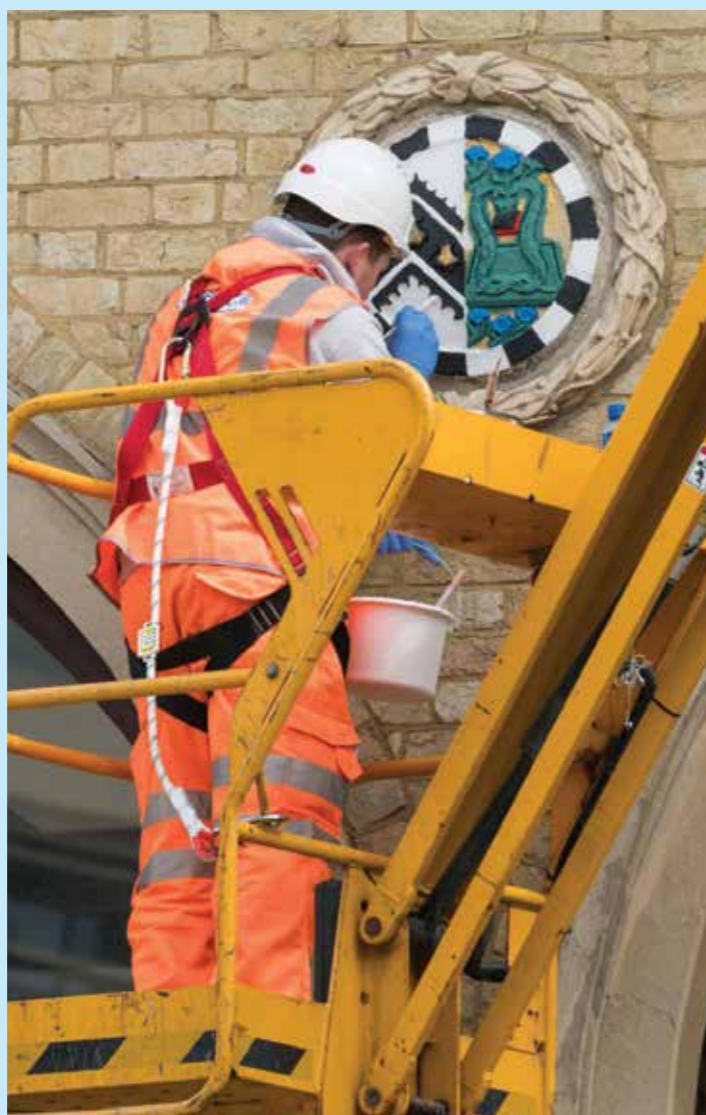
CAMBRIDGE STATION: Craftsman at work on the roundels