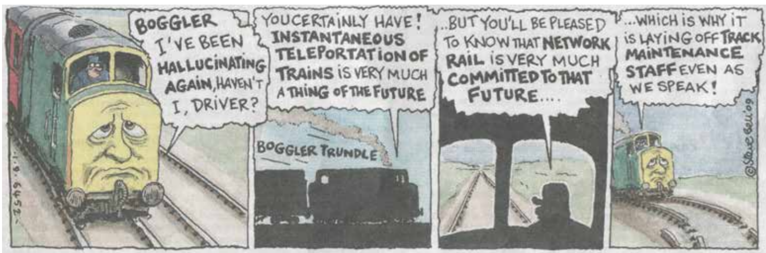
FUTURE TRACTION: Steve Bell's If cartoon originally appeared in The Guardian in 2009 but may fit the bill in 2018 as well

□ Solar-powered lights have been installed at Chappel and Wakes Colne station on the Sudbury-Marks Tey line, funded by the Association of Community Rail Partnerships, Essex and South Suffolk Community Rail Partnership, and Wakes Colne Parish Council.