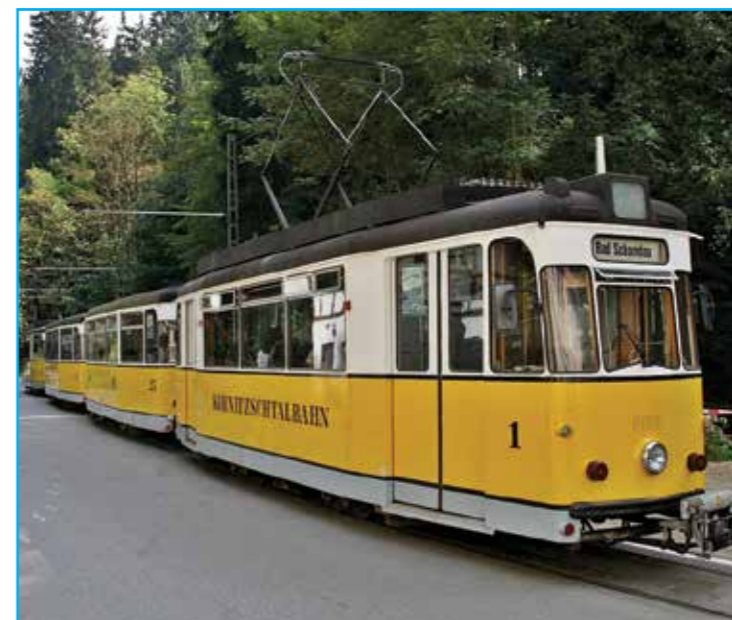
About 20% of the power needed to run a 10-mile tram line in southern Germany is being produced from solar panels. The line runs along the Kirmitsch valley from Bad Schandau to Sebnitz, close to the Czech border. The solar panels are on the roof of the depot

10:10 believes solar could power 20% of the Merseyrail network in Liverpool, as well as 15% of commuter routes in Kent, Sussex and Wessex. There could be scope for solar trams in Edinburgh, Glasgow, Nottingham, London