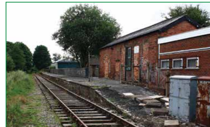
SURVIVOR WITH A FUTURE: Endon station slumbers on the Stoke-Leek line which lost its regular passenger services in 1956. The line has been leased from Network Rail by Moorland & City Railways, and some track clearance has already been done by the volunteers of the adjacent Churnet Valley Railway. A planning application to reinstate the rail line from Leekbrook (on the preserved Churnet Valley Railway) to Cornhill was made in November by Staffordshire Moorlands District Council, following a feasibility report on bringing the trains back to Leek. The cost of reinstating Leekbrook station and repairs at Cheddleton station was agreed earlier. Council leader Sybil Ralphs told The Sentinel newspaper: "The first stage is to bring the heritage railway line into Leek, then build the station at Barnfields. This will happen as I am very passionate about the railway line. Once the heritage line is in place we can look to future plans for taking the line to Stoke-on-Trent." Leek station closed to passengers in 1965

increase was recorded by the regional sector (3.5%) followed by long distance with 2.8%. However London and South East services once again showed a fall in passenger-kilometres, though the 0.8% drop was at least an improvement over the startling