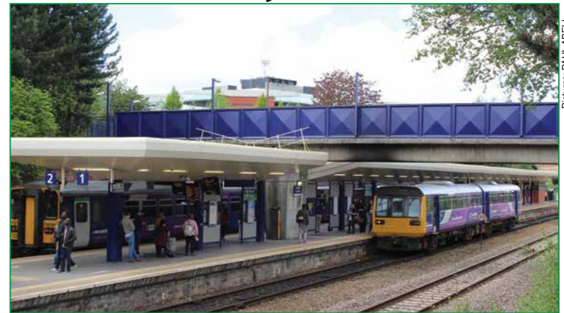
SUCCESS ON A SHOESTRING: The Government kept British Rail short of money in the 1980s but it still managed to build new stations. Our picture shows two trains at Salford Crescent which opened in 1987. It cost £660,000 and was paid for jointly by BR and the Greater Manchester Passenger Transport Executive. The station has proved such a success that it was extended in 2013 to cope with the 1.5 million passengers who use it each year. It will be even more attractive to passengers when the diesel-powered Pacer at Platform 1 is replaced. More than 100 years ago, the Lancashire and Yorkshire Railway phased out non-bogie coaches on such services but, always under pressure to save money, BR reinvented the four-wheeled train design with the Pacer in the 1980s

The railway passenger figures published by the Office of Rail and Road covering July-September 2017 are worrying. The overall increase in passenger-kilometres was only 1.3% over the previous year (admittedly an improvement over the tiny 0.3% increase recorded for the previous three months). The greatest