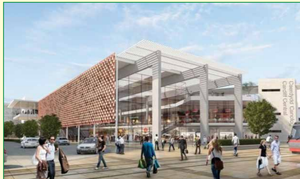
An artist's impression of the south side of Cardiff Central station. See below

Railfuture Wales expressed its concern over the reliability and performance of services in South Wales. Many GWR services were cancelled on either side of the Christmas holiday with little or no publicity at stations. On Christmas Eve GWR halved its service out of Swansea. The introduction of new Hitachi class 800 trains since the New Year has led to trains with insufficient capacity and short-notice cancellations, being far higher than normal, with only one day of the week commencing