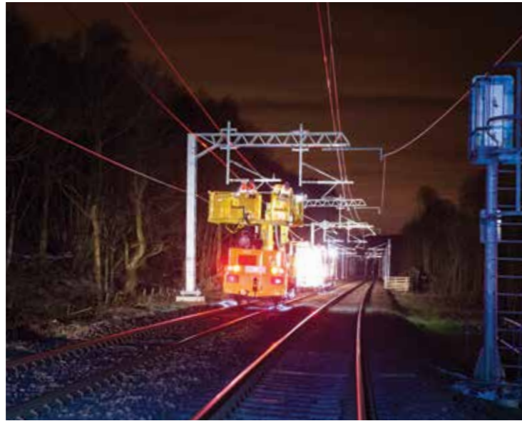
SCOTLAND SHOWS THE WAY: Work to electrify the Glasgow-Edinburgh line via Falkirk Grahamston. There will soon be five electrified routes between the two cities. Manchester, Leeds and Sheffield will have to make do with diesels – and dreams

It would however be difficult to convince the House of Commons public accounts committee, which has been concentrating on short-term lack of efficiency. Railfuture must nevertheless campaign vigorously, especially