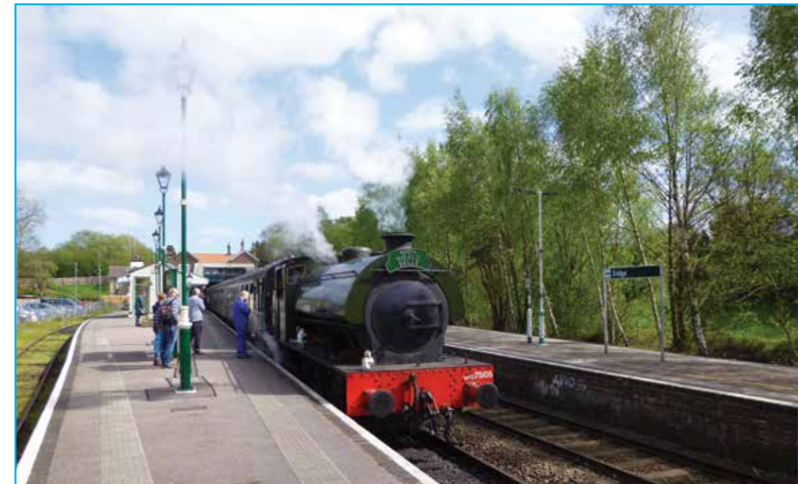
ERIDGE IN 2015: A simple connection at Eridge allows passengers to transfer from the national network at Uckfield to the steam train for Tunbridge Wells West. The Department for Transport is consulting about how to provide more links with heritage railways