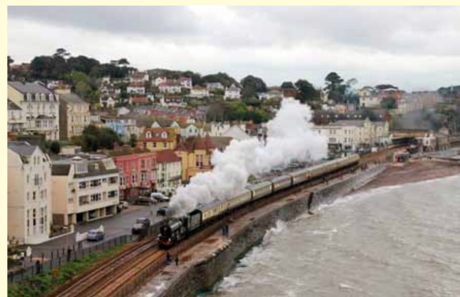
PULLING POWER: Main line steam trains attract crowds and help support local economies too. This Vintage Trains charter in 2012 is heading through Dawlish to Plymouth

authorities and the railways should work together to identify any opportunities and, like local lines in the national network, a subsidy should be available if required to support such a service. Justification would be on the normal criteria for new rail projects.