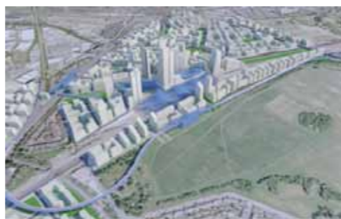
An impression of the city which is expected to grow up around Old Oak Common station by 2048

Reliability, which is usually narrowly interpreted as punctuality, is acknowledged as essential. But a reliable system punctuated