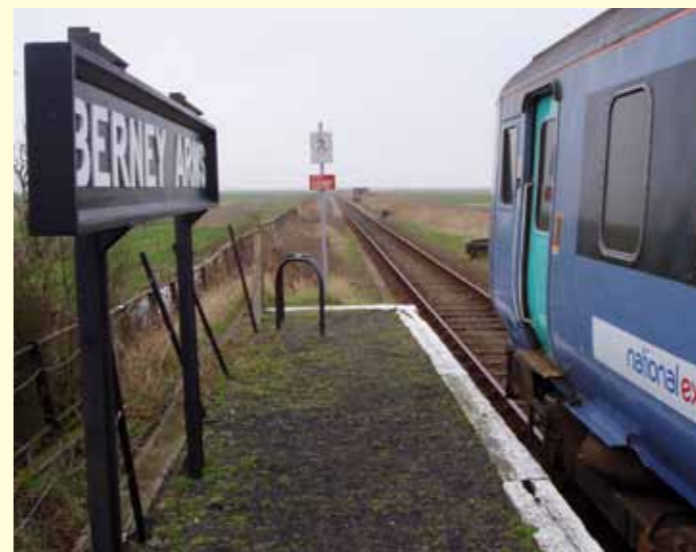
NOT A ROAD IN SIGHT: Berney Arms station with a Norwich to Great Yarmouth train about to cross Halvergate Marsh

bases for walking, so get your boots out and help to swell the numbers on these trains.