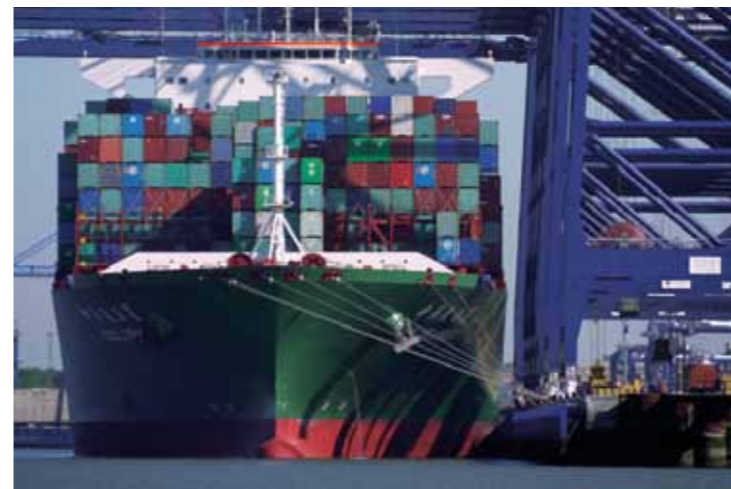
Container ship at Felixstowe docks in Suffolk