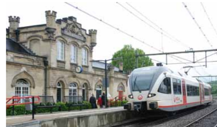
A Maastricht-Heerlen train, run by Veolia, at Valkenburg in the Netherlands where the 1853 station imitates the town's castle

A visit was also made to the regional transport authority centred on Aachen, the Aachener