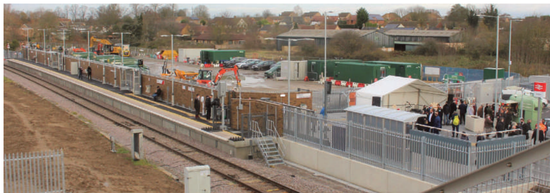
CELEBRATION: Guests, including Network Rail chair Sir Peter Hendy, gather for the reopening of Soham station in December, putting the town with a 10,800 population back on the network

In a letter to Mr Hancock, the proposal was found "suitable for Restoring Your Railway funding in principle" and "a good case for future development", but disappointingly was turned down for funding in the third round of the Ideas Fund because of the number of other applications and the limited funding available. We have been advised that other sources of funding are available and the DfT team have been asked to "keep the scheme