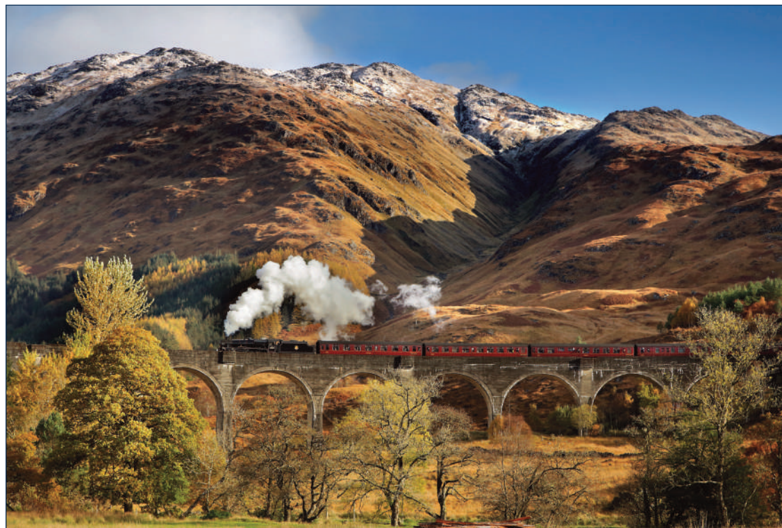
2021 WINNER: Glenfinnan Viaduct by Malcolm Blenkey won the Lines in the Landscape category

On trams, he was warned months ago that the system was unsafe but inaction led to the suspension of the system. Metal cracks were