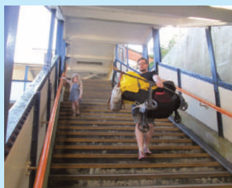
Another burden for parents

Network Rail and train operator South Western Railway will pay £3 million to install two lifts (goods-only lifts will be replaced by passenger lifts) at Pokesdown and make improvements to the footbridge. But the plan could