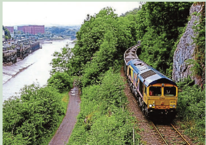
DELAY: Delays have hit the scheme to get passenger trains running through the Avon Gorge to Portishead. At present, the line is used only by freight trains to Portbury Docks