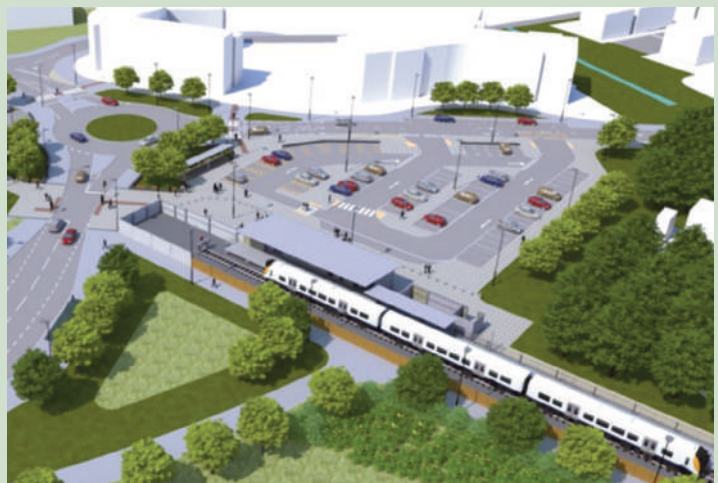
An impression of what Portishead station will look like

to approximately 30,000 residents and pressure on the area's road network continues to increase.