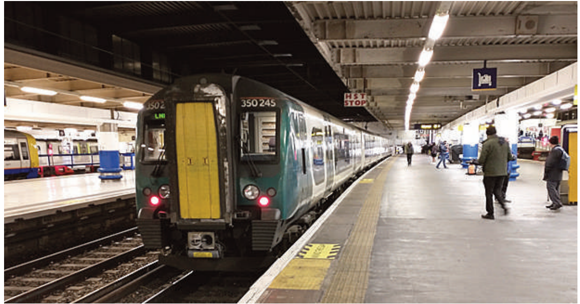
LONDON'S EUSTON STATION: An electric train for the first direct service on 13 December 2021

The train service currently on offer in some parts of the country is simply unattractive, not only to existing rail users but also to potential customers. The off-peak cuts in service save very