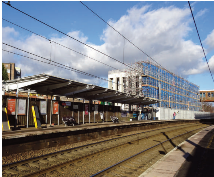
Birmingham's University station: Getting ready for the Games

www.railfuture.org.uk/WestMidlandsBranch