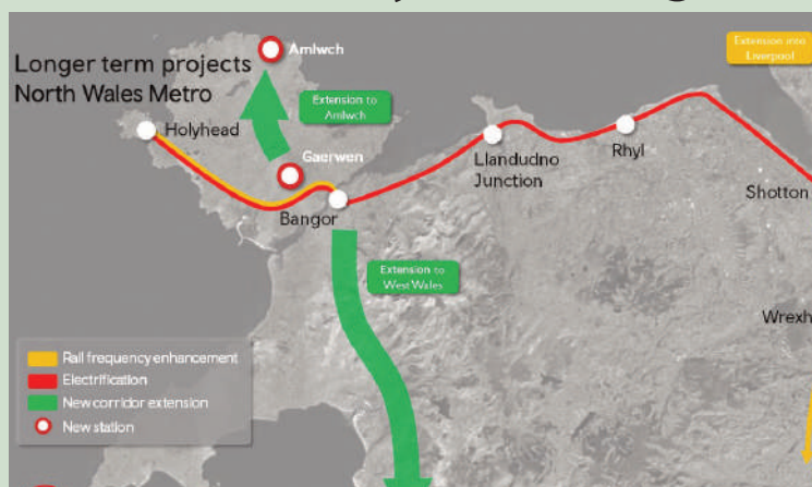
Map: TRANSPORT for WALES