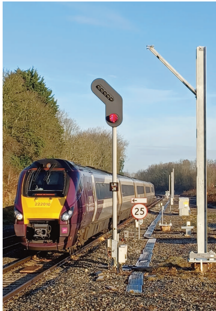
A diesel passenger train nearing the platform at Market Harborough station, past recently installed electrification masts

With the expected emergence of Great British Railways, the planned state-owned public body that will oversee rail