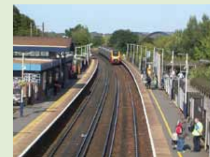
Southampton Airport station