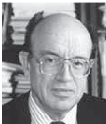
AUTHOR: Professor Vuchic

The books, though expensive, are clear, well-bound and comprehensive. The mathematical presentation, whilst intimidating, is in fact little more than railway clerical entrance examination standard and can be easily conquered by anyone with a good pocket calculator and a basic knowledge of