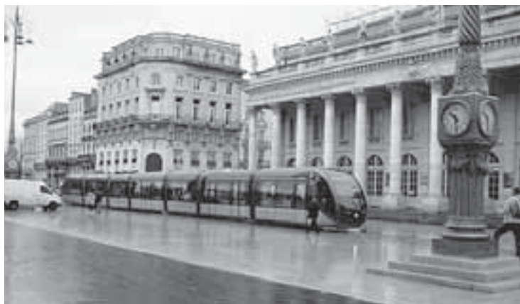
An Alstom Citadis tram in Bordeaux

Our guide was Isabelle Taillet of Veolia, which operates the tram system. It was interesting to hear that "the bus must not be the poor relation - it's a network", and that there is a significant "isolation factor" for drivers on a modern tram,