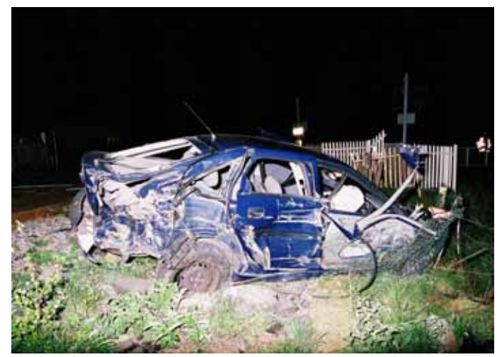
WRECKED: The car hit by a train near Burscough

In its submission, ATOC said "we believe the new structure delivers