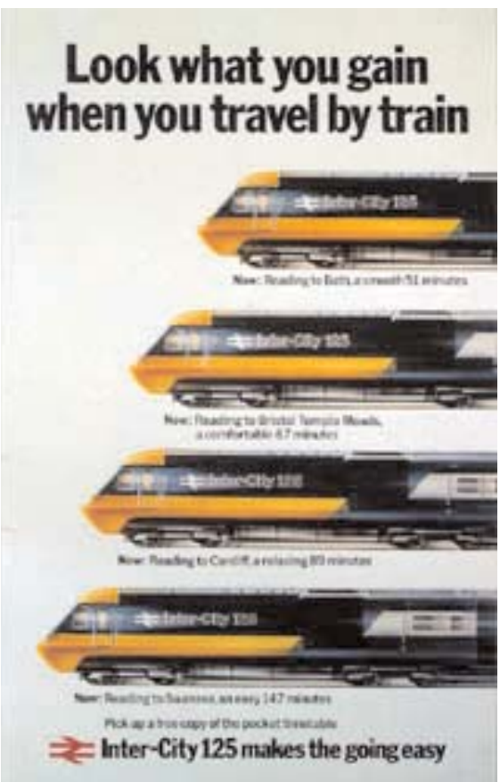
The railways looked more modern and forward-looking in 1975, as this poster shows, than they do now. It's a terrible indictment of the Tories who brought us a botched privatisation and Labour which has waited seven years before getting to grips with the basic problems

TV personality and DJ Jimmy Savile joined forces with Arriva Trains Northern to help celebrate the 50th anniversary of the Yorkshire Dales National Park.