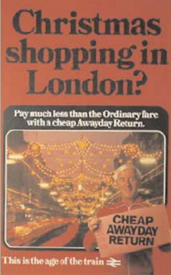
Jimmy Savile was helping to promote the benefits of rail travel as long ago as 1975, in the poster, left, which can still be seen on the National Railway Museum's website at www.nrm.org.uk/ In the poster right, dating from 1982, he is advertising BR's range of gift vouchers.