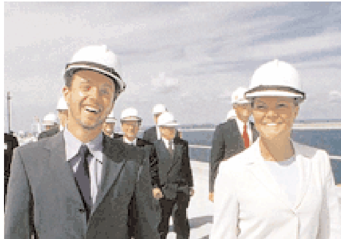
Plenty to smile about: Crown Prince Frederik of Denmark and Crown Princess Victoria of Sweden at an Oresund link opening ceremony

Some members may know that this involved building a massive road and rail bridge over one half of the Oresund, together with a tunnel under the other half, plus an artificial