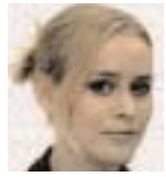
By Alix Stredwick RDS Campaigns Director

It's certainly a busy time for transport campaigners, and rail campaigners in particular. Transport is likely to be one of the hottest potatoes for Labour when the next election comes round. The Transport Bill has been published, with a whole section devoted to rail issues, following on from the Railways Bill last year.